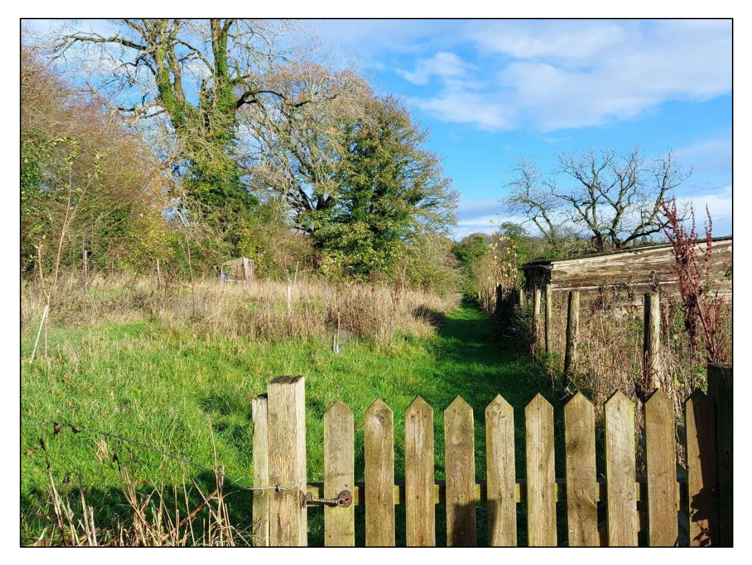
The Community Orchard